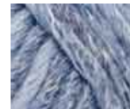
8985 shaded denim