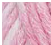
8275 candy pink