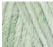
8955 shaded lime