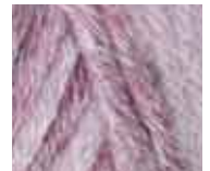
8357 grape fizz