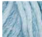
8386 lt. ocean