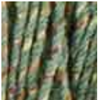
6632 cactus flower