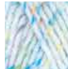
6301 baby white